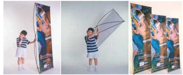
Easy setup and handling