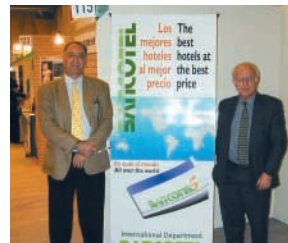
XL1 36" x 84", stand alone