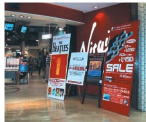
XL2 30" x 84", 3 units