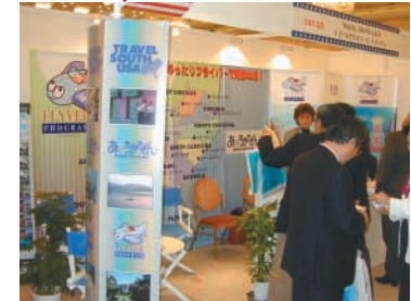
XL2 30" x 84", 7 units