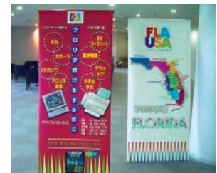
XL1 36" x 84", 2 units