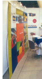
Takes no space