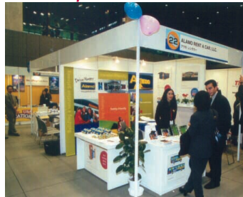
XL2 36" x 84", 3 units