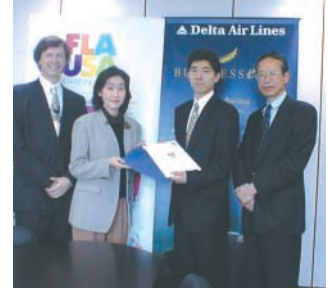
XL2 36" x 84", 2 units