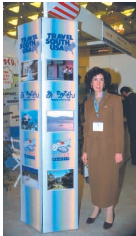
XL2 15" x 84", 2 units