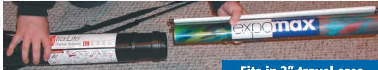
Fits in 3" travel case