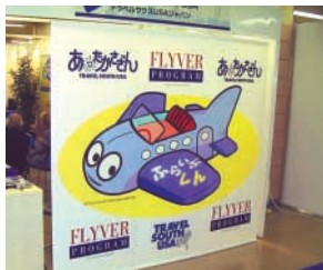
XL2 30" x 84", 3 units

Call us today at 1-800-861-7051 . We can answer any questions you may have and help you decide how to meet your requirements. Or visit us online at expomax.com to make an inquiry or view our online presentations.